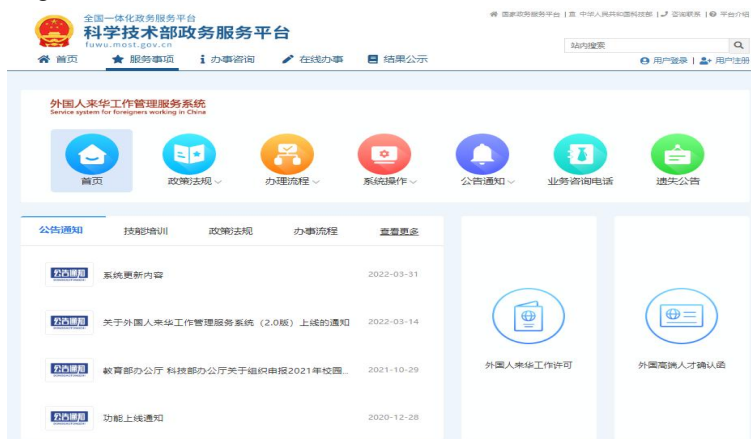
Home Page of the Government Affairs Service Platform of the Ministry of Science and Technology

After accessing the Service System for Foreigners Working in China, https://fuwu.most.gov.cn/html/fwsx/wgrlhq/ , (it is recommended to log in with Google or 360 Extreme Explorer), the page will be directed to the Government Affairs Service Platform of the Ministry of Science and Technology first, please choose legal person registration, fill in the relevant information as required, wait for the approval of the Ministry of Science and Technology, then, the page will be redirected to the Service System for Foreigners Working in China. (For detailed steps, please refer to the guidelines provided by the Government Affairs Service Platform of the Ministry of Science and Technology. If you have any questions, please contact 010-88659000 or fuwu@most.cn .) After that, please fill in the working unit information according to the requirements, save all the information, and then print the Organization Registration Form.